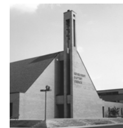
Ridgecrest Baptist Church

5:00 p.m. Finger Food Fellowship & Missions Displays -